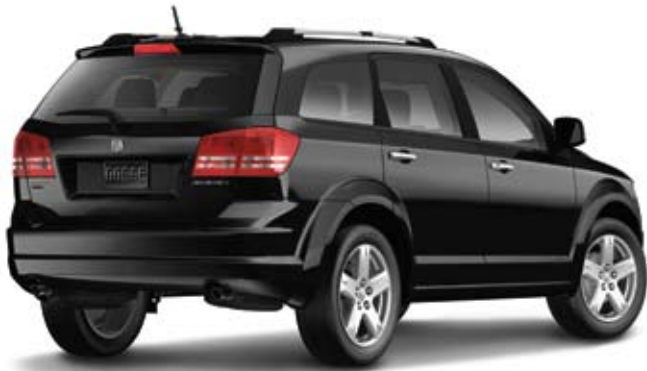
Brilliant Black Crystal Pearl