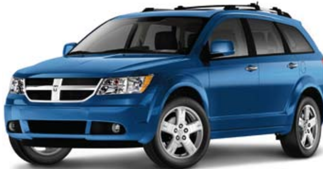
Deep Water Blue Pearl