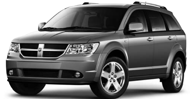
Silver Steel Metallic