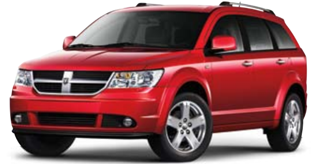
Inferno Red Crystal Pearl