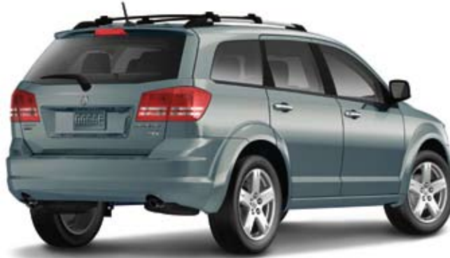
Bright Silver Metallic